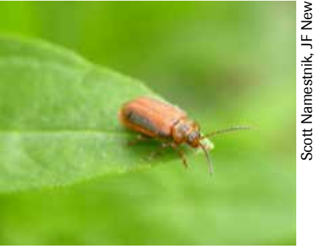
Galerucella beeetle used for biocontrol of purple loosestrife

Biological control is a bad idea, because it involves the MYTH #7: release of non-native insects or pathogens that could damage native plants in addition to the targeted invasive plants.