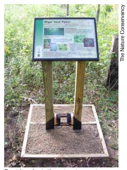
Boot brush station at entrance to nature preserve