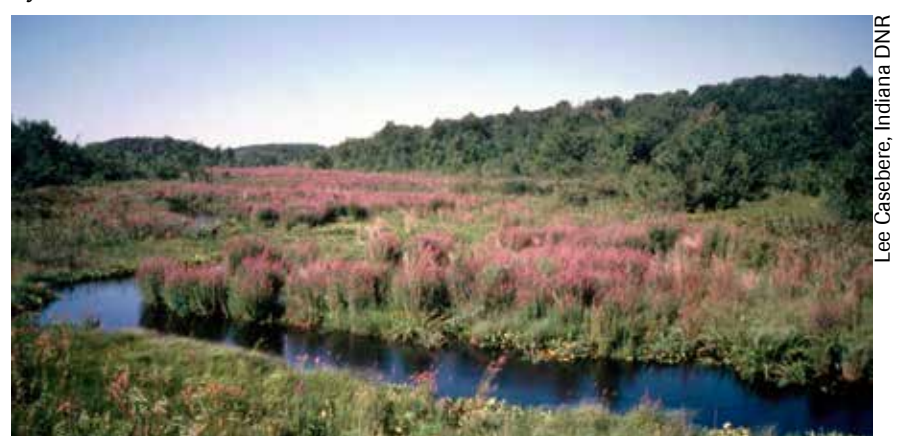
Purple loosestrife invading a stream bank

An invasive plant is defined as a plant that is not native and has negative effects on our economy, environment, or human health. Not all plants introduced from other places are harmful. The term "invasive" is reserved for the most aggressive plant species that grow and reproduce rapidly, causing major changes to the areas where they become established.