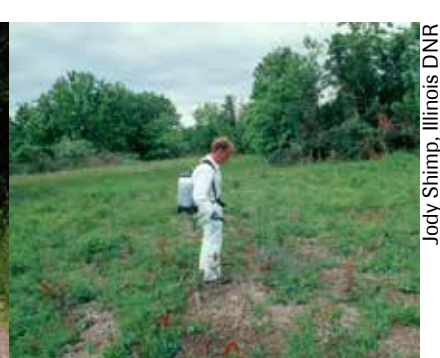
Using herbicide to control invasive plants