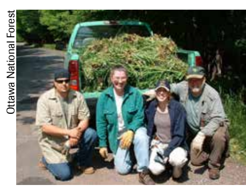
Hand-pulling invasive plants

FACT: This is true in some instances. Small infestations of some species, such as garlic mustard, can be removed by hand-pulling. However, hand-pulling for large infestations leaves large patches of disturbed soil, and often seeds from the seed bank will germinate and re-colonize areas where garlic mustard has been removed. Properly-timed cutting or mowing can also control some species, however, perennials such as Canada thistle should not be cut or pulled. Removing only part of the plant will only stimulate growth and produce more plants. Combining cutting with herbicides can be an effective method of treatment for many species.