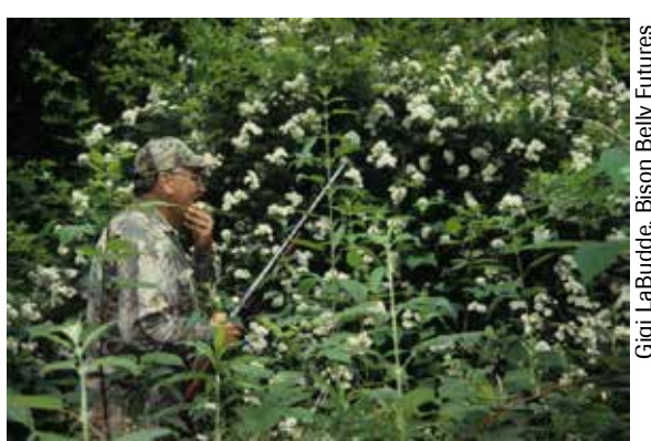
Hunter in a patch of multiflora rose

shade out oak tree seedlings and saplings and, over time, reduce the oak component of a forest. Fewer acorn-producing trees mean lower food availability and reduced habitat quality for wildlife such as white-tailed deer, squirrel, grouse, and turkey.