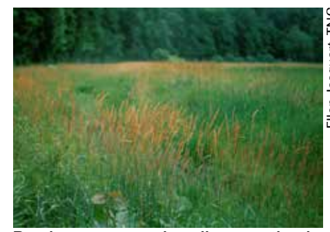
Reed canary grass invading a wetland

ticulture, medicine, or other uses. The species of concern are those that become invasive, taking over native ecosystems and crowding out native species. It is often difficult to know in advance if a new species that is introduced will become invasive, so great caution should be used when importing or planting new species.