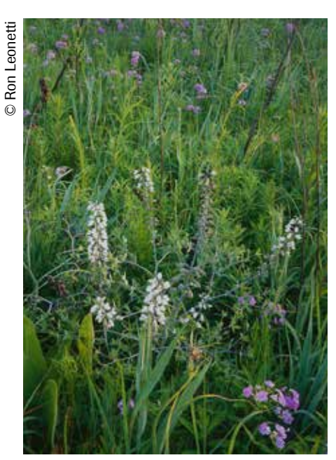
Native prairie plants

slowing the rider and stirring up dust as they are dragged.