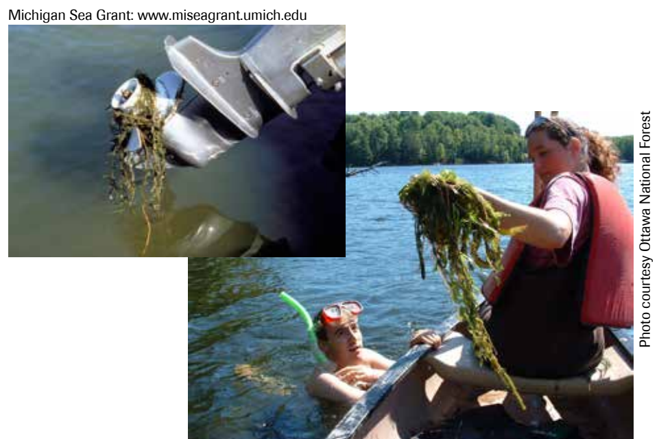
Examples of the havoc that Eurasian watermilfoil can wreak on water recreation

One common underwater invader is Eurasian watermilfoil, an aggressive plant that reduces native plant diversity and degrades fish habitat. Studies have shown that Eurasian watermilfoil supports fewer aquatic invertebrates, a vital source of food for fish, than native plants do. It also reduces oxygen levels in the water, leading to fish stress and fish kills, and clogs water intakes on motors causing engines to overheat.